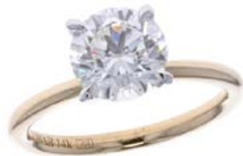
14KT Yellow and White Gold 2.00ctw Diamond Engagement Ring Style #: 001-105-00263 $31,250