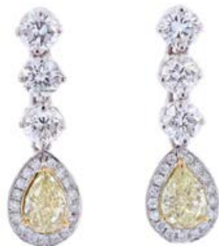
18KT White and Yellow Gold 4.28ctw Yellow and White Diamond Dangle Earrings