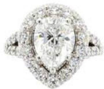
18KT White Gold 5.26ctw Diamond Engagement Ring Style #: 001-798-00403 $97,450