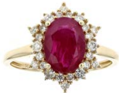
14KT Yellow Gold Natural Ruby and 0.41ctw Diamond Ring Style #: 001-790-01259 $1,990