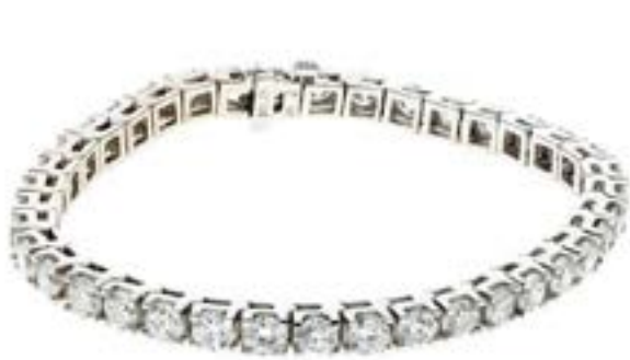
14KT White Gold 11.73ctw Diamond 7" Estate Tennis Bracelet Style #: 001-791-00297 $35,250