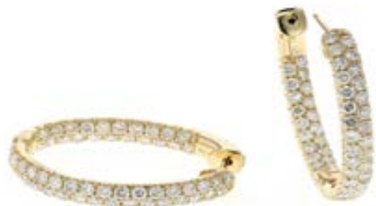
14KT Yellow Gold 3.00ctw Diamond Cluster Hoop Earrings