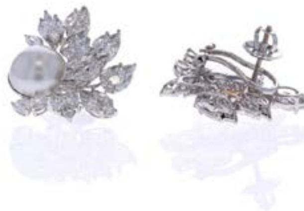
18KT White Gold Pearl and 6.90ctw Diamond Earrings