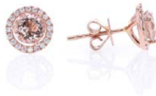
14KT Rose Gold Morganite and 0.21ctw Diamond Stud Earrings