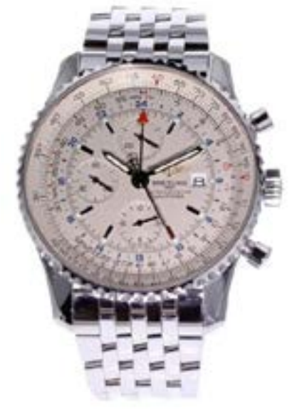
Breitling Navitimer World A2432212 46mm 2019 Style #: 001-783-01121 $7,800