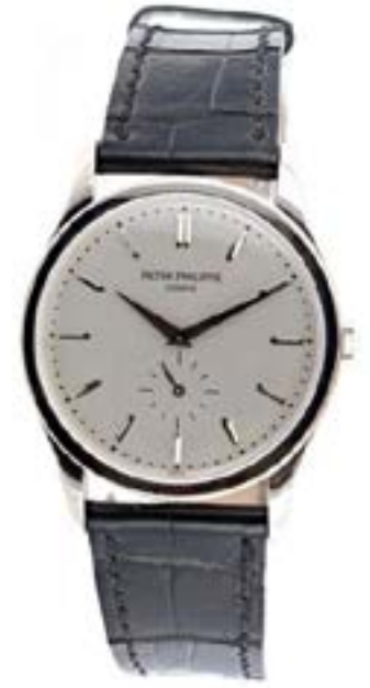
Patek Philippe Calatrava 5196G 37mm Style #: 001-783-01699 $29,500