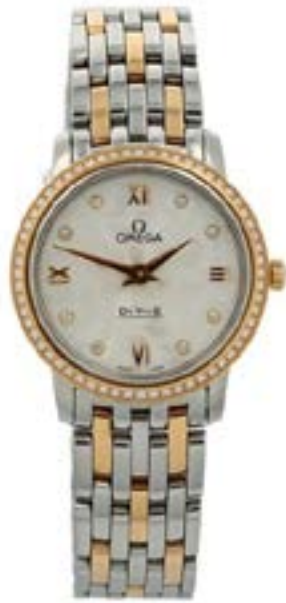
Omega DeVille Prestige Quartz 424.25.27.60.52.001 27.4mm 2022 Style #: 001-783-01671 $9,750