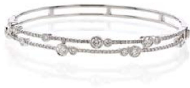
Simon G - 18KT White Gold 1.82ctw Diamond Bangle Style #: 001-170-00188 $11,285