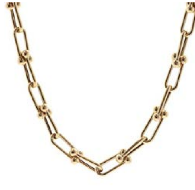
14KT Yellow Gold 20" 7.0mm Tiffany Style Hardware Necklace