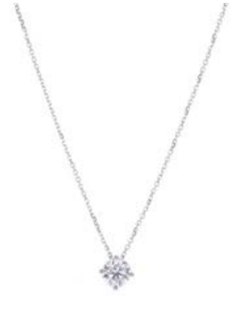
14KT White Gold 0.90ctw Diamond Pendant