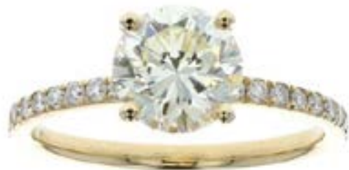
18KT Yellow Gold 1.90ctw Diamond Engagement Ring