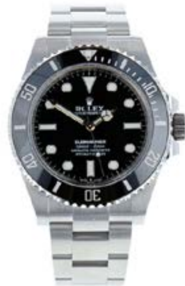
Rolex Submariner 124060 41mm 2022 Style #: 001-783-01524 $19,995