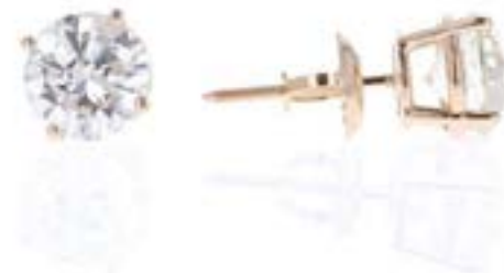
14KT Yellow Gold 2.00ctw Diamond Estate Stud Earrings