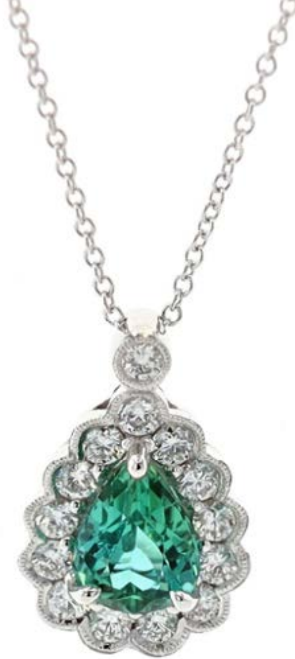
Simon G - 18KT White Gold Green Tourmaline and 0.45ctw Diamond Necklace