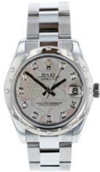
Rolex Datejust Goldust 178344 31mm 2011 Style #: 001-783-01548 $18,750