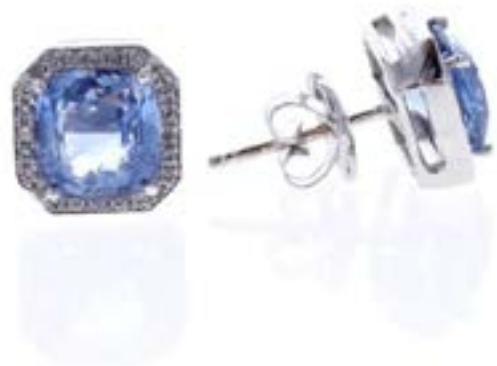
18KT White Gold Natural Blue Sapphire and 0.20ctw Diamond Earrings