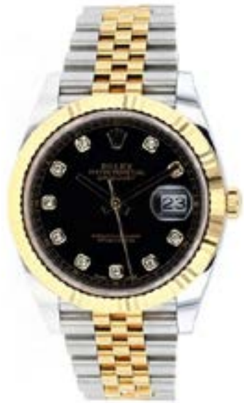
Rolex Datejust 41 126333 2019 Style #: 001-783-01589 $23,400