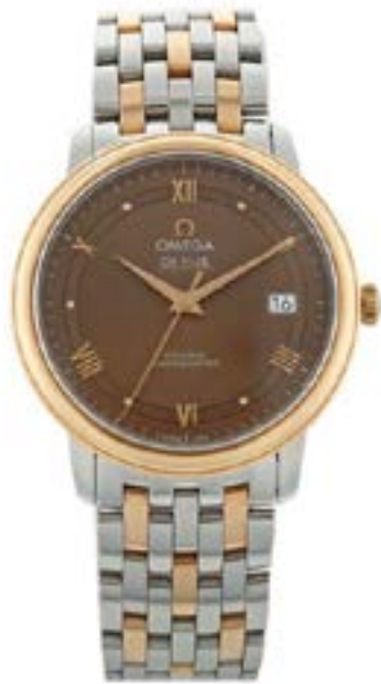
Omega DeVille Prestige 424.20.37.20.13.001 36.8mm 2022 Style #: 001-783-01674 $6,450