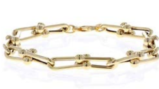
14KT Yellow Gold 8" 7.0mm "Tiffany Style Hardware" Bracelet Style #: 001-440-01147 $1,400