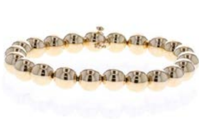
14KT Yellow Gold 7.5" 8.9mm "Tiffany Style" Ball Bracelet Style #: 001-440-01145 $2,500