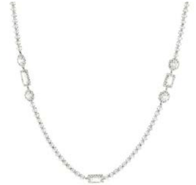
18KT White Gold 9.30ctw Diamond 26" Tennis Necklace