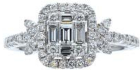
18KT White Gold 0.67ctw Diamond Ring Style #: 001-130-00832 $2,780