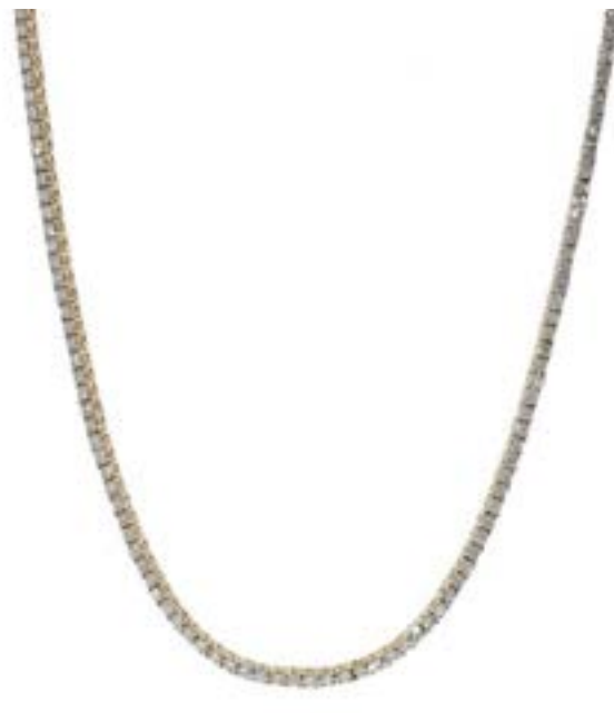
14KT Yellow Gold 4.84ctw Diamond 17" Estate Tennis Necklace