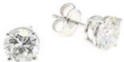
14KT White Gold 3.02ctw Diamond Estate Stud Earrings