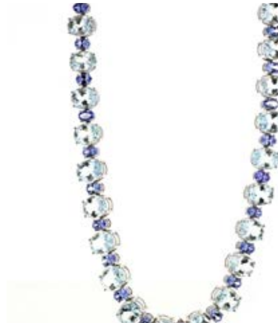
14KT White Gold Aquamarine and Tanzanite Necklace