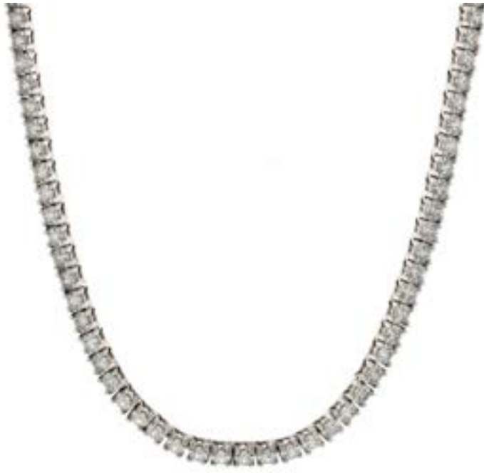
14KT White Gold 11.66ctw Diamond 17" Tennis Necklace