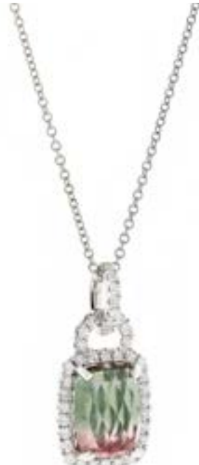
Simon G - 18KT White Gold Watermelon Tourmaline and 0.22ctw Diamond Necklace