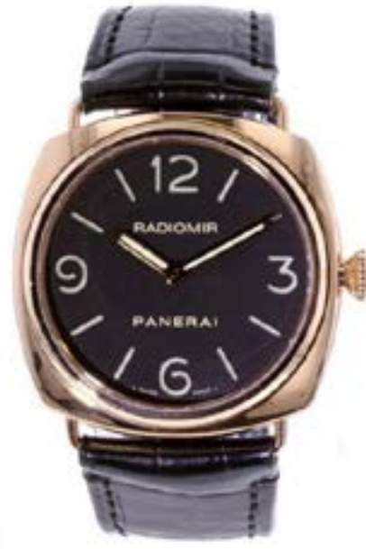
Panerai Radiomir PAM231 45mm 2018 Style #: 001-783-01198 $16,800