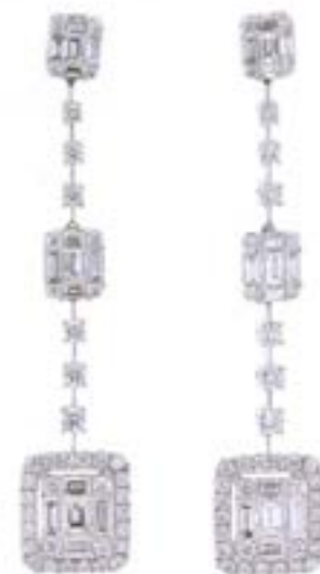
18KT White Gold 3.50ctw Diamond Earrings