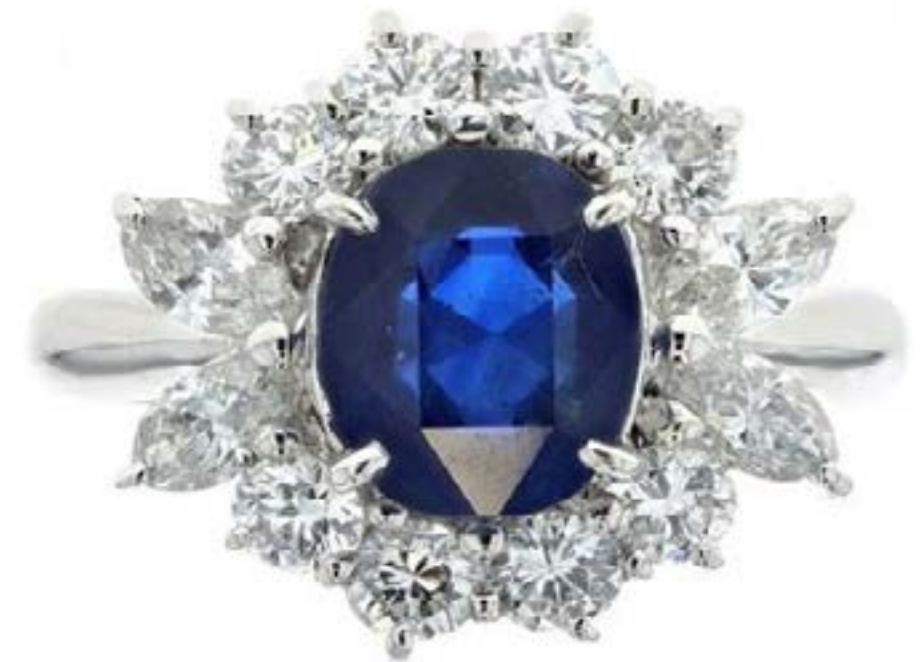
Platinum Natural Blue Sapphire-Burma and 1.51ctw Diamond Ring