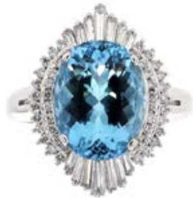
Simon G - Platinum Aquamarine and 0.87ctw Diamond Ring