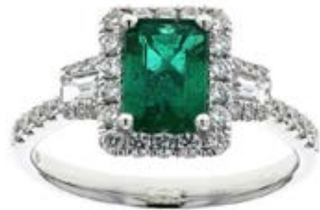
18KT White Gold Emerald and 0.54ctw Diamond Ring