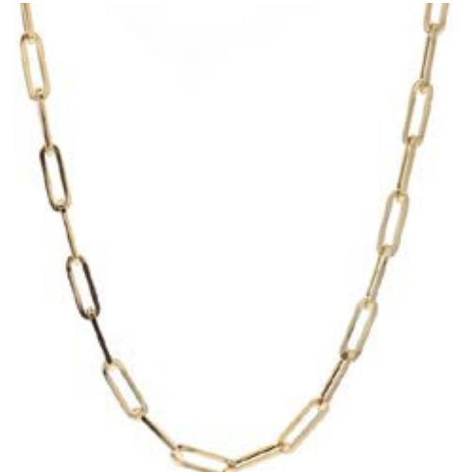
14KT Yellow Gold 20" Paper Clip Chain