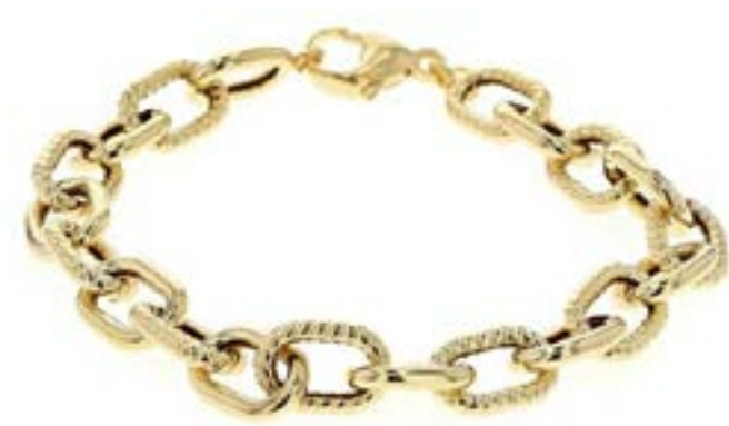
14KT Yellow Gold 8" Oval Link Bracelet Style #: 001-440-01220 $1,555