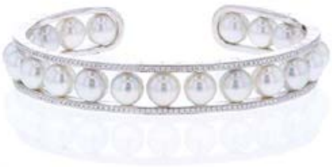
18KT White Gold 7.5-8mm Japanese Akoya and 1.35ctw Diamond Cuff Bracelet Style #: 001-330-00038 $31,750