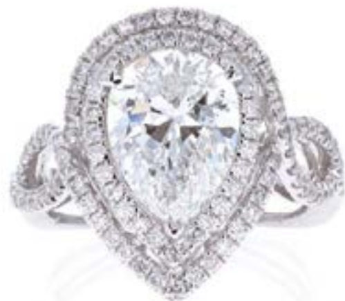
18KT White Golde 2.84ctw Pear Cut Diamond Engagement Ring